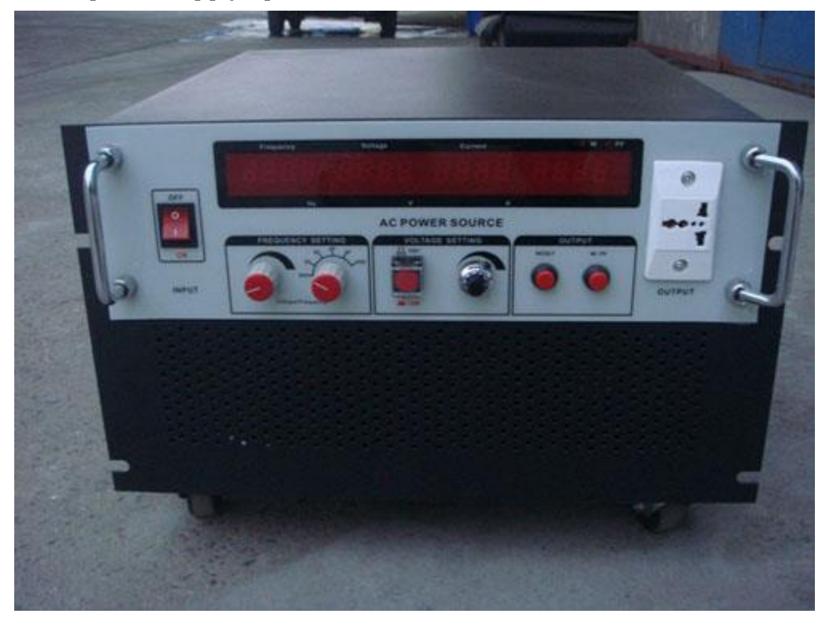
RMC-400VATStunner Physical map

RMC series stunner motor power is with the microprocessor as the core, made of MPWM, designed with active components IGBT module, using a digital division, D / A conversion, instantaneous value feedback, Sinusoidal Pulse Width Modulation technology,etc. Making the unit capacity up to 400KVA, and use isolation transformer output to increase machine stability, which is with strong load adaptability, good output waveform quality, easy operation, small size, light weight and other characteristics, and it is with short circuit, over current, overload, overheating protection function, in order to ensure reliable power supply operation.